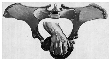
Uterus gravid 90 days.