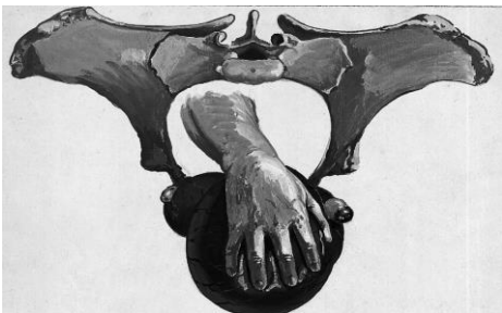
Uterus gravid 110 days.